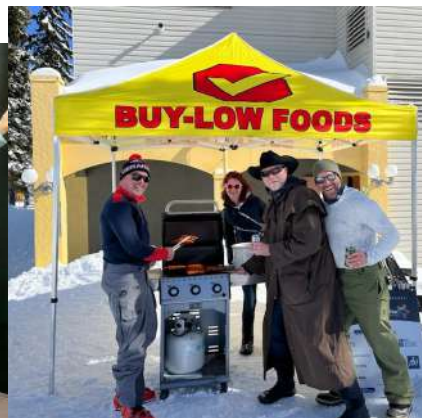
On hill

How to end our race season at SilverStar? With the KalTire Round Up of course! All teams took to the race centre to show off their costumes and skills on the speed trap, Kombi course, dual panel GS and long jump followed by a BBQ sponsored by Buy-Low Foods and awards.